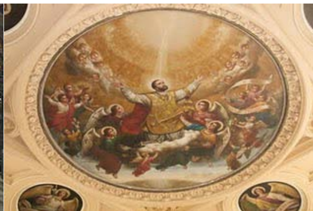
Photo 2: Restored, center, ceiling medallion, The Apotheosis of St. Francis Xavier.