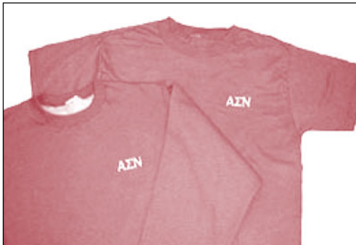
Actual Color~Maroon with Gold Embroidery Sweatshirts~90% Cotton-10% Poly T-Shirts~100% Cotton