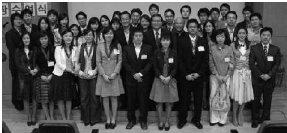
Sogang University's 2006 Inductees (Seoul, Korea)