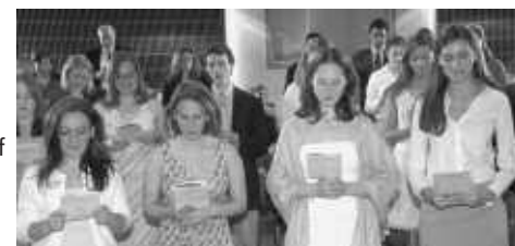
Loyola College 2006 inductees recite the AΣN pledge.