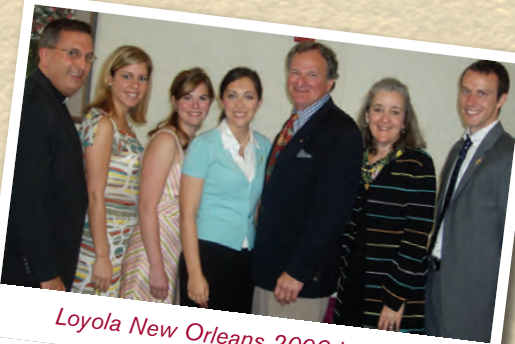
Loyola New Orleans 2006 induction