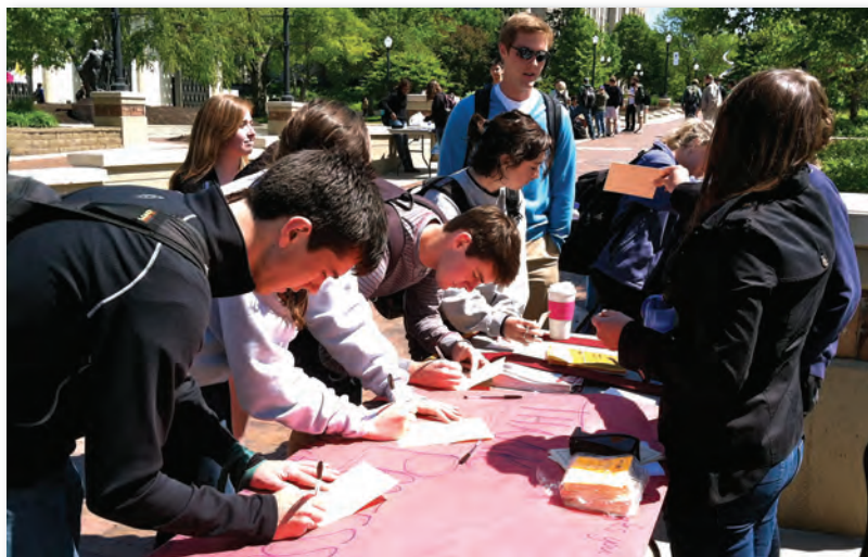
Creighton Chapter members running the faculty/staff thank you note project