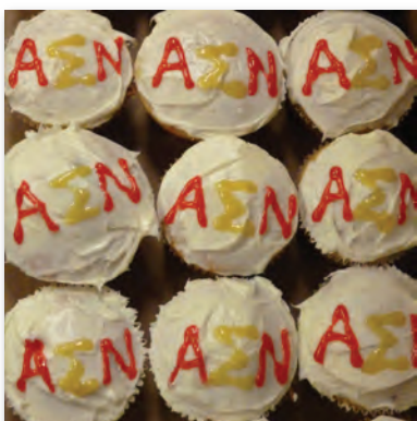
Cupcakes made and distributed by Le Moyne Chapter members for AΣN Week