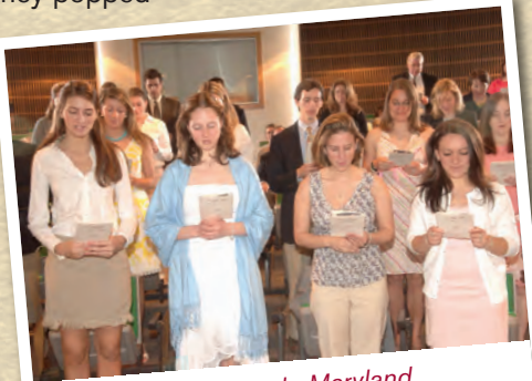
2005 Loyola Maryland inductees reciting the pledge