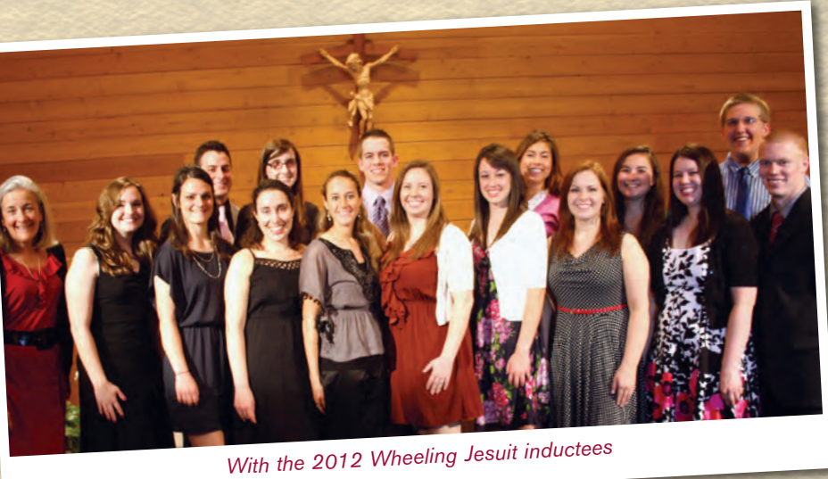
With the 2012 Wheeling Jesuit inductees