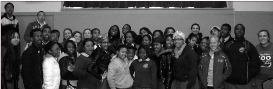
Saint Joseph's Chapter with students from West Philadelphia Catholic High School.