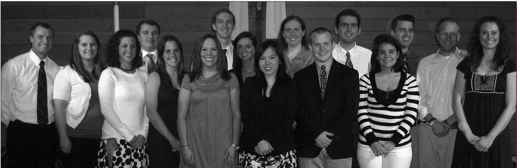
2010 Wheeling Jesuit inductees