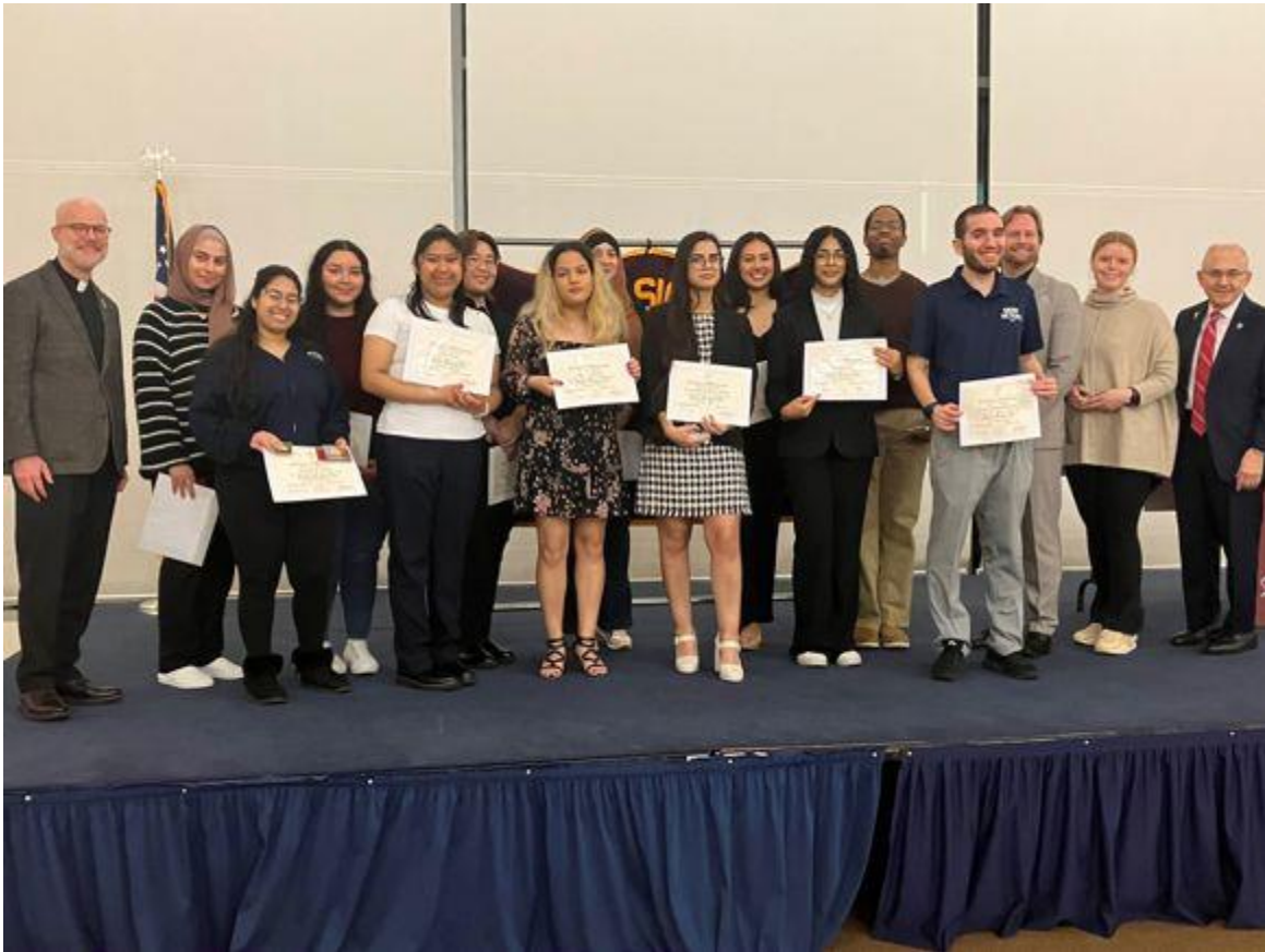
Pictured above are new inductees at the Alpha Sigma Nu induction ceremony at Saint Peter's University (Jersey City, NJ) on Jan. 31, 2024